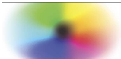
CUSTOM COLORS AVAILABLE

Due to chemical composition, thickness, application methods and job site conditions, individual colors may vary across product lines.